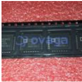
DAC8412FPCZ Analog Devices, Inc PLCC-28