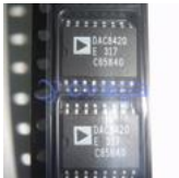
DAC8420ES Analog Devices, Inc SOIC-16