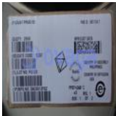
DAC8512FSZ Analog Devices, Inc SOP-8