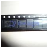
ADAS3023BCPZ Analog Devices, Inc LFCSP-40