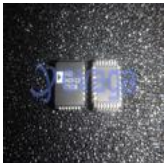
DAC8413FPC Analog Devices, Inc PLCC-28