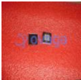
ADATE305BSVZ Analog Devices, Inc TQFP-100