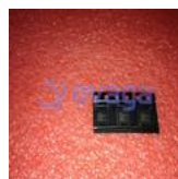
ADV7390BCPZ Analog Devices, Inc QFN32