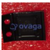
ADV7391WBCPZ Analog Devices, Inc LFCSP-3