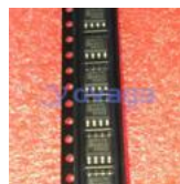
AD8170AR Analog Devices, Inc SOP8