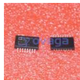
ADUM4160BRIZ Analog Devices, Inc SOIC-16