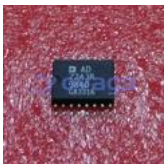
AD724JR Analog Devices, Inc SOIC-16