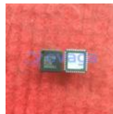
ADV7393BCPZ Analog Devices, Inc LFCSP-VQ-40