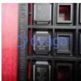
ADV7341BSTZ Analog Devices, Inc LQFP-64