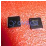
ADV7181CBSTZ Analog Devices, Inc LQFP-64