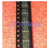
AD8170AR Analog Devices, Inc SOP8