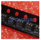
IRLTS6342TRPBF Infineon Technologies Corporation TSOP-6