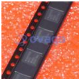
ADAS3022BCPZ Analog Devices, Inc LFCSP-40