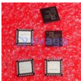
AD7124-8BCPZ-RL7 Analog Devices, Inc LFCSP-32