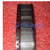
AD7401YRWZ Analog Devices, Inc SOIC-16