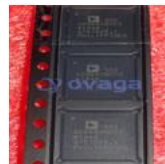
AD9680BCPZ-500 Analog Devices, Inc LFCSP-64