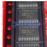
AD7192BRUZ-REEL Analog Devices, Inc TSSOP-24